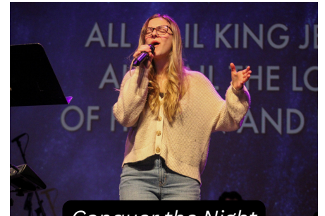
Conquer the Night