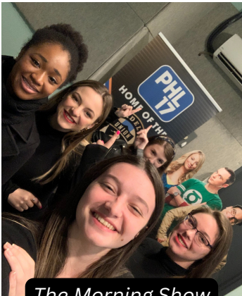
The Morning Show