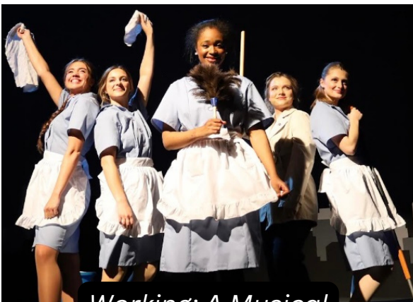
Working: A Musical