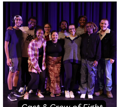
Cast & Crew of Fight